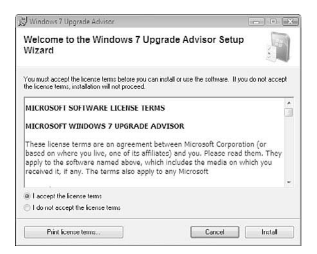
Figure 3-1 You must accept the license terms to run the Windows 7 Upgrade Advisor.

Step 7. The Windows 7 Upgrade Advisor displays the page shown in Figure 3-2. Ensure that you have connected and turned on all peripheral devices (such as printers) so that they can be checked. Then click Start check .