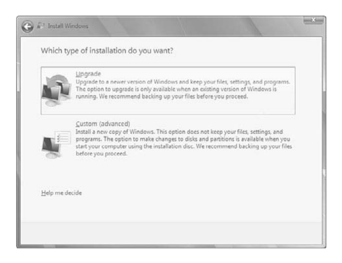
Figure 3-4 The Which type of installation do you want? page offers you a choice between upgrading or performing a clean installation.

Step 7. Setup checks for compatibility issues and displays the Compatibility Report page with information about any applications or drivers that are