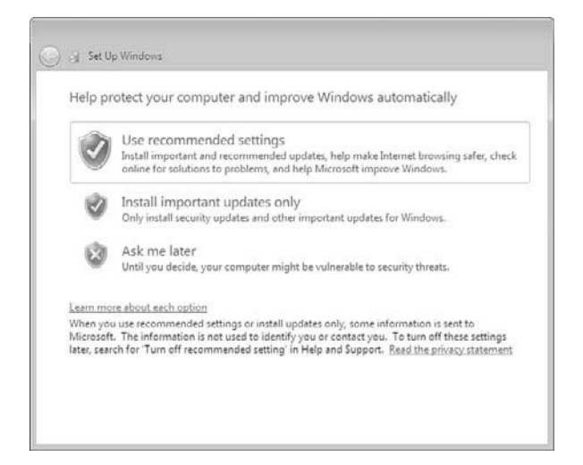
Figure 3-6 Select Use recommended settings to ensure optimum protection for your computer.