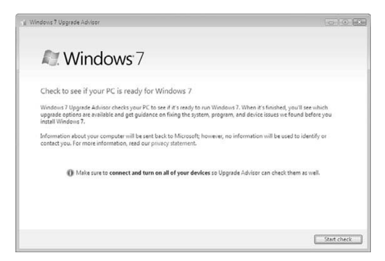
Figure 3-2 The Windows 7 Upgrade Advisor displays this introductory page.

Step 8. The Upgrade Advisor checks the hardware and software on your computer and then displays a report window similar that shown in Figure 3-3, which indicates any issues it might have found with your computer. Click the links provided if you need additional information.