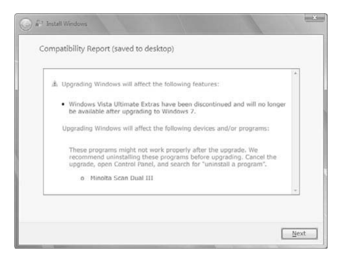
Figure 3-5 The Compatibility Report screen describes items that might be incompatible with the upgrade to Windows 7.

not supported in Windows 7 (see Figure 3-5). Note the information provided and then click Next . If the compatibility check does not find any issues, this page might not appear.