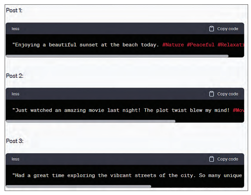
FIGURE 1-2 Unstructured data representation

To tackle these challenges, cloud-based storage solutions such as Azure Blob Storage provide scalable and cost-effective repositories for unstructured data. Advanced analytics platforms, such as Azure Cognitive Services, leverage machine learning algorithms to derive insights from unstructured data sources.